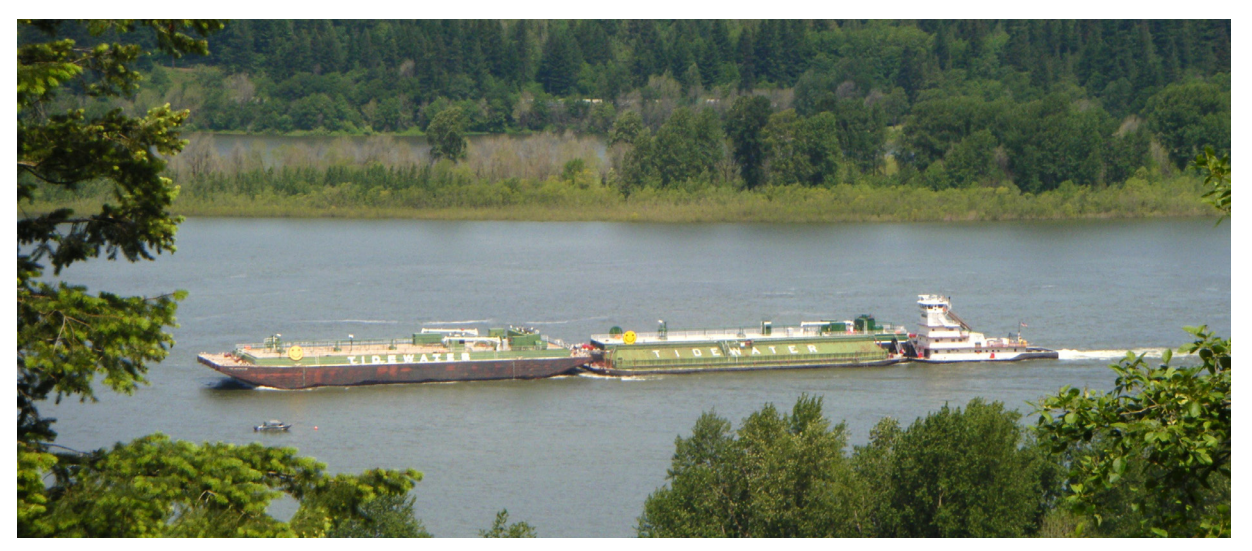
By Sarah McD from Portland, OR, USA (Tidewater Barge - Columbia River) [CC BY 2.0 (http://creativecommons.org/licenses/by/2.0)], via Wikimedia Commons

Pembina proposes building a $500 million propane export terminal. The City of Portland's Planning and Sustainability Commission recently voted to amend a zoning code to allow the terminal to be built. The