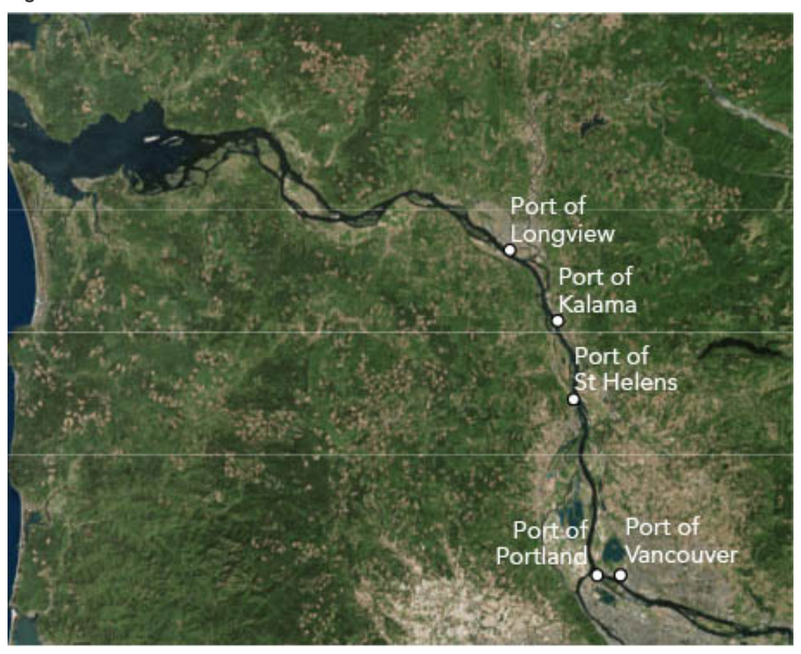
Figure 1: Columbia River Ports