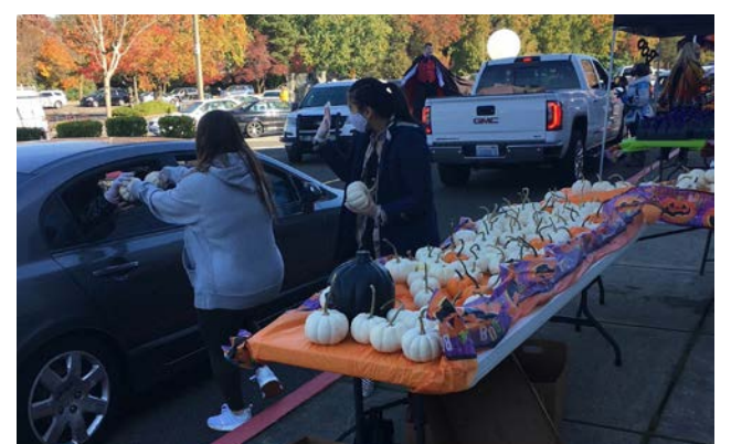
Above, port staff enjoyed an old-fashioned outdoor movie night at Port of Ridgefield in July.