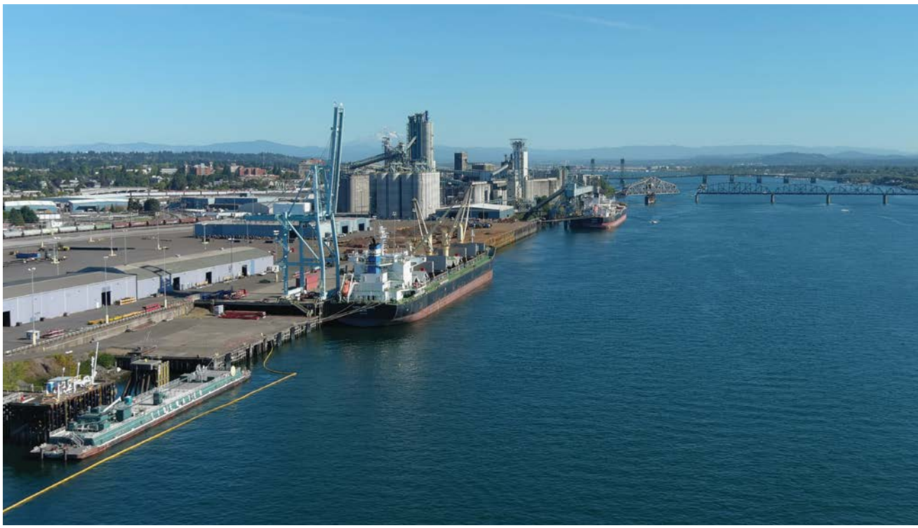
The port's Climate Action Plan will guide investment in a clean future.