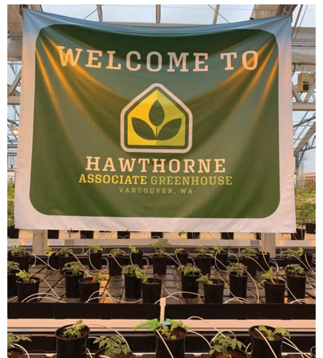
Hawthorne associates show off their green thumbs in producing food for local families.