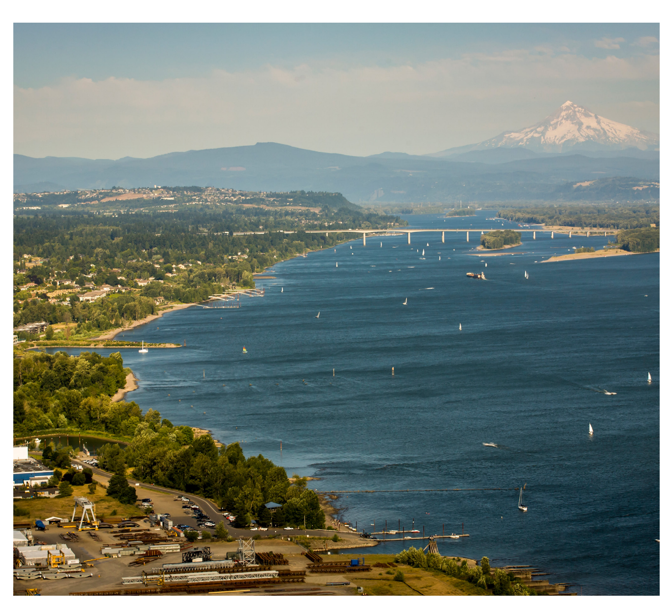
Aerial view of the Columbia River and Mount Hood

The port hires skilled labor and purchases materials to help our crews maintain port equipment and infrastructure. As a regional