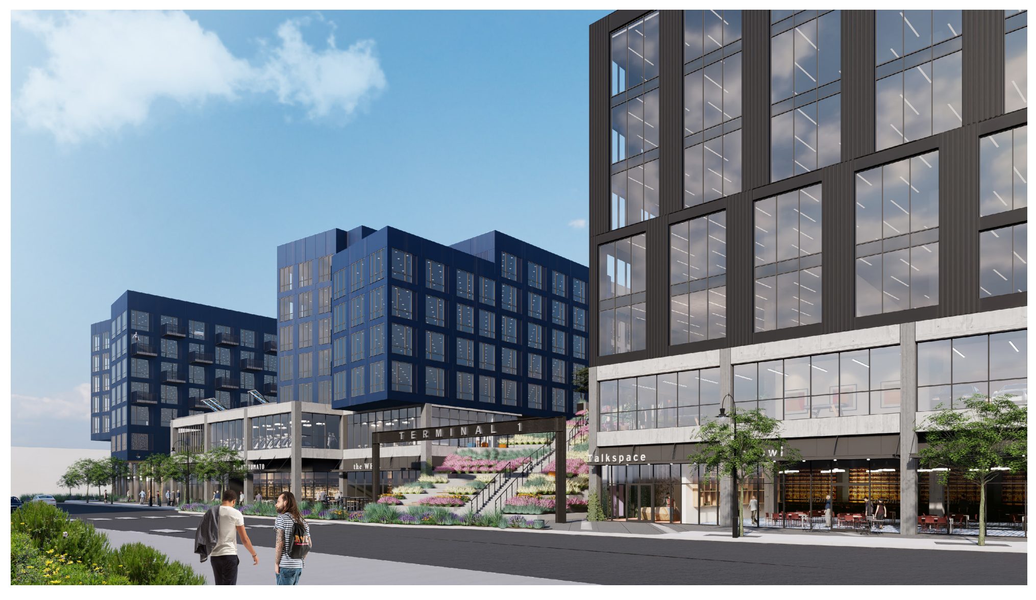
The latest conceptual rendering for the mixed-use development at Terminal 1