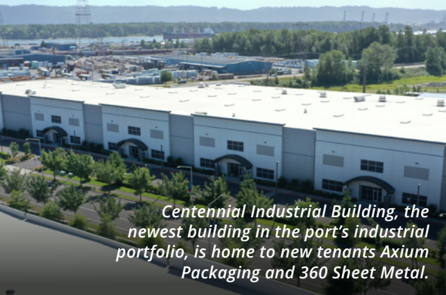
Centennial Industrial Building, the newest building in the port’s industrial portfolio, is home to new tenants Axium Packaging and 360 Sheet Metal.

Ohio-based packaging maker Axium moved into the port’s Centennial Industrial Building in July—the business’s first location in Washington. Axium will utilize its new 75,000 square foot facility at the port to bolster its creation of packaging used in food, health care, nutrition products and more.