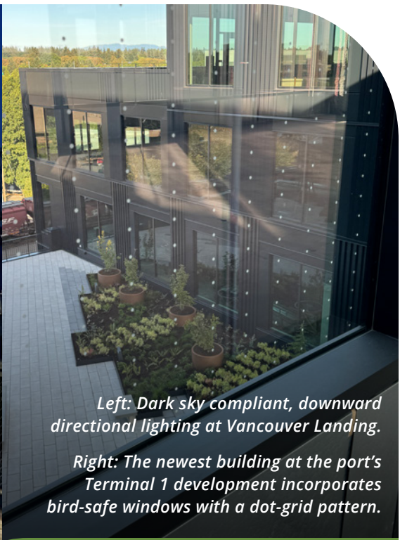
Left: Dark sky compliant, downward directional lighting at Vancouver Landing.