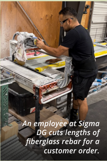
An employee at Sigma DG cuts lengths of fiberglass rebar for a customer order.

own line of concrete forming hardware for its proprietary fiberglass threads. To keep up with the products’ growing popularity across North America, Sigma plans to hire more full-time employees.