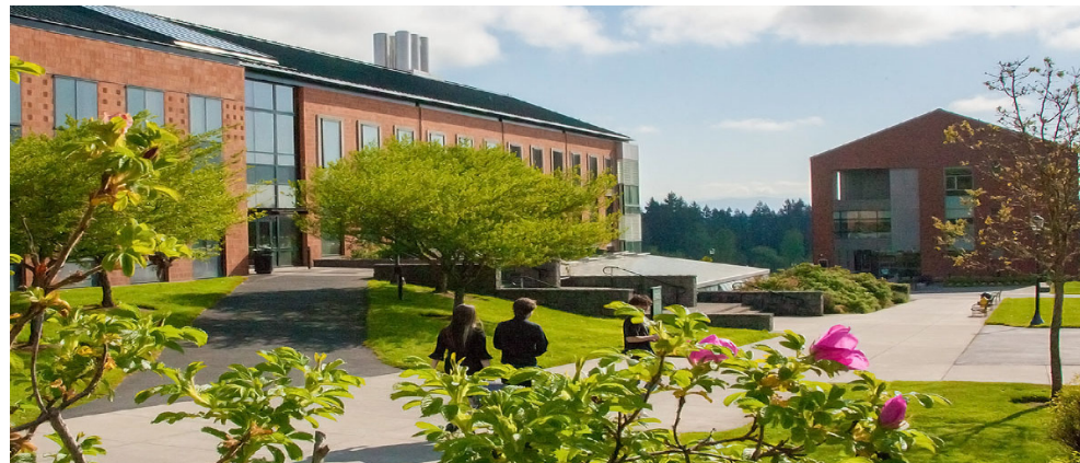
Washington State University, Vancouver- Bachelors in Business Administration, Finance