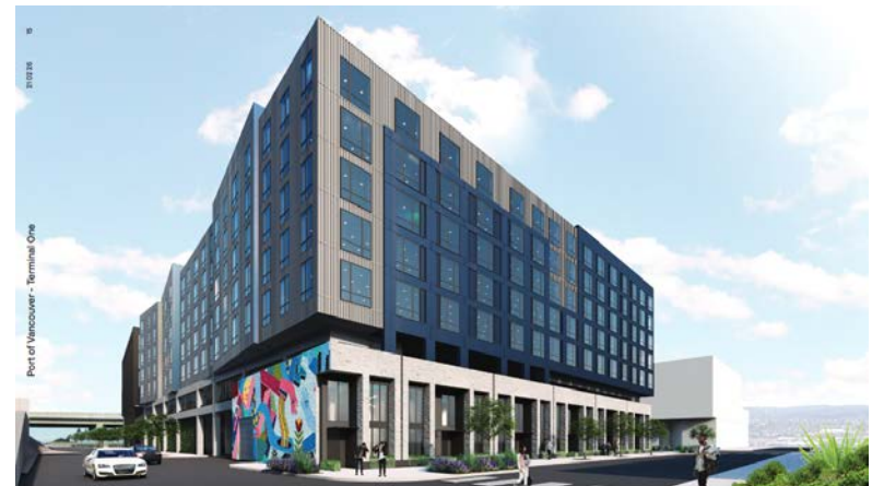
EXTERIOR | VIEW OF NW CORNER PARCEL C