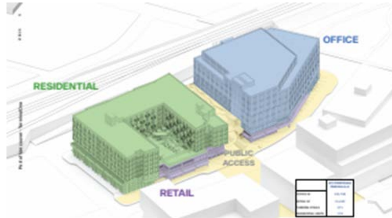
CONCEPT | PROGRAMMING