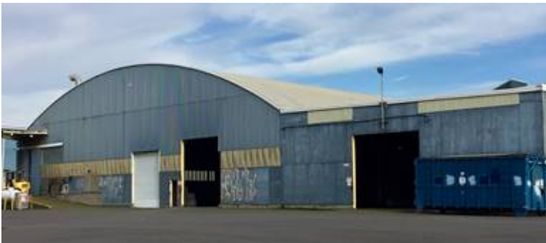
West Side of Warehouse