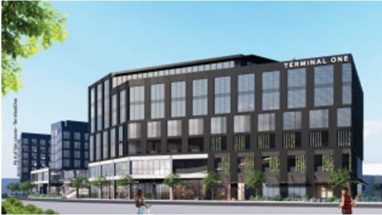
EXTERIOR | VIEW OF SE CORNER PARCELS