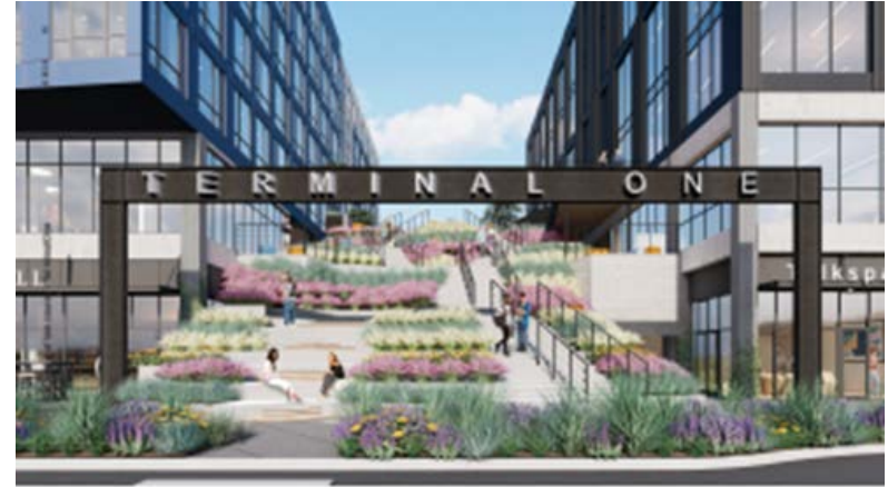
EXTERIOR | VIEW OF STAIR ENTRY