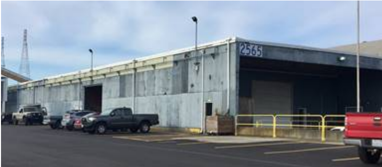
South Side of Warehouse