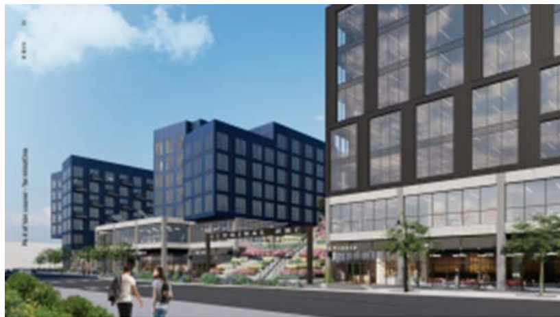
EXTERIOR | VIEW FROM COLUMBIA WAY