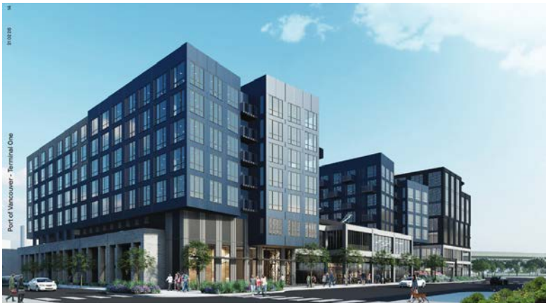
EXTERIOR | VIEW OF SW CORNER PARCEL C