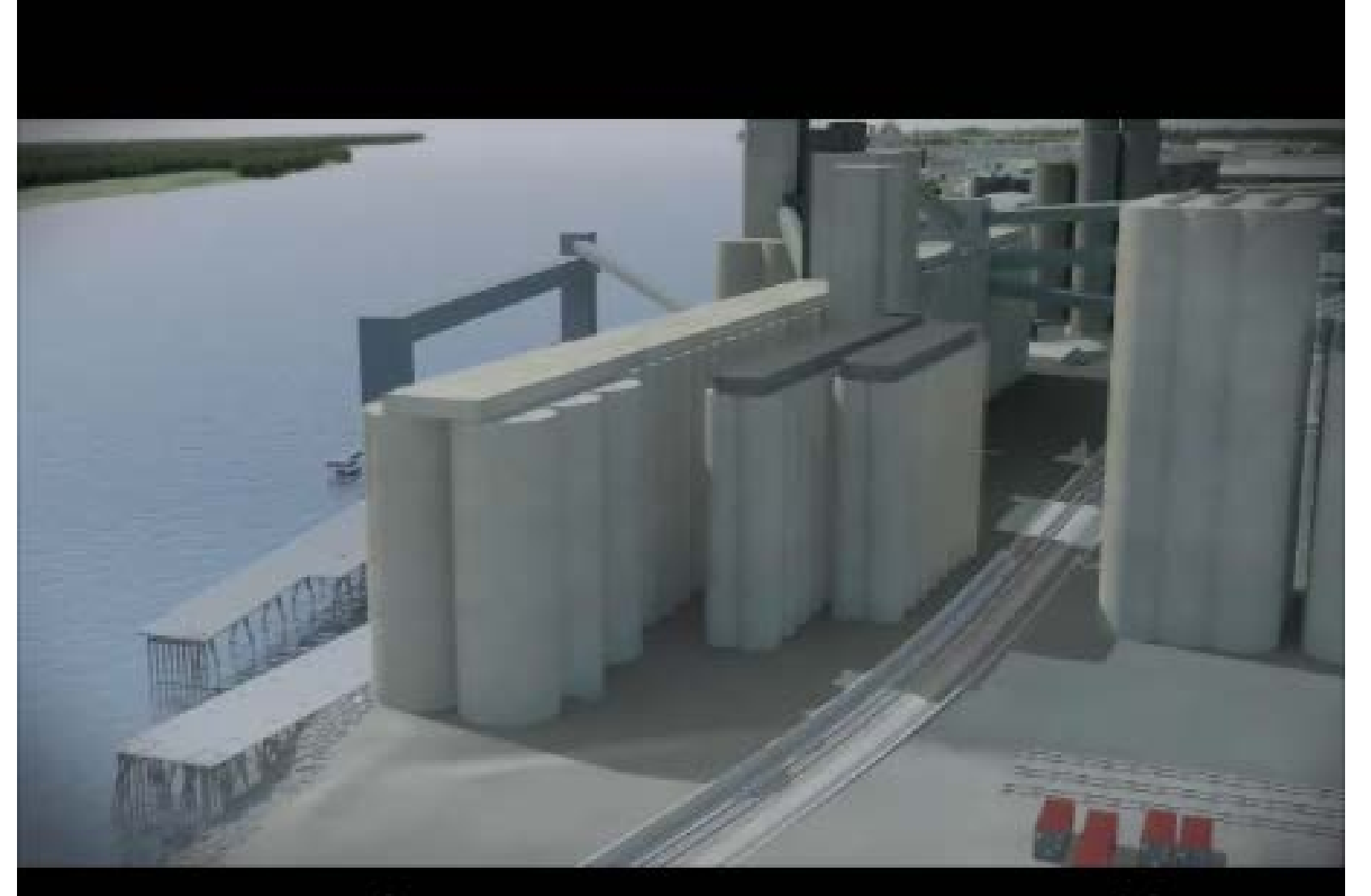
WVFA Project #13-15 Great Western Malting