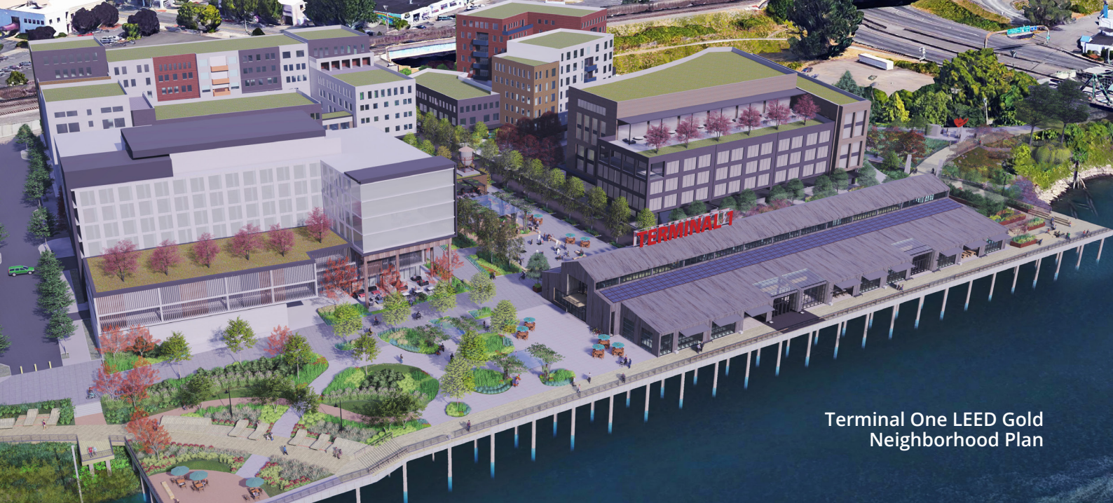
Terminal One LEED Gold Neighborhood Plan